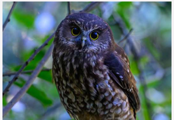
Ruru | Morepork