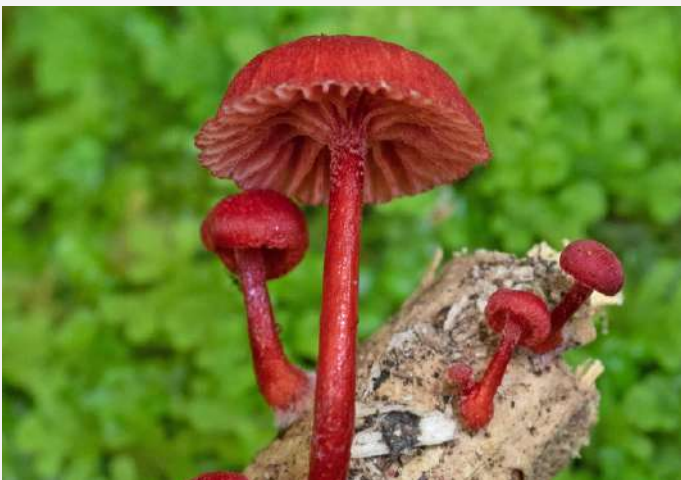
Cruentomycena viscidocruenta