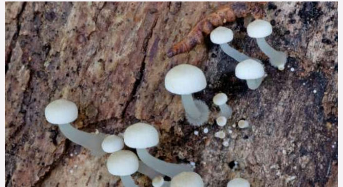
Roridomyces austroroidus