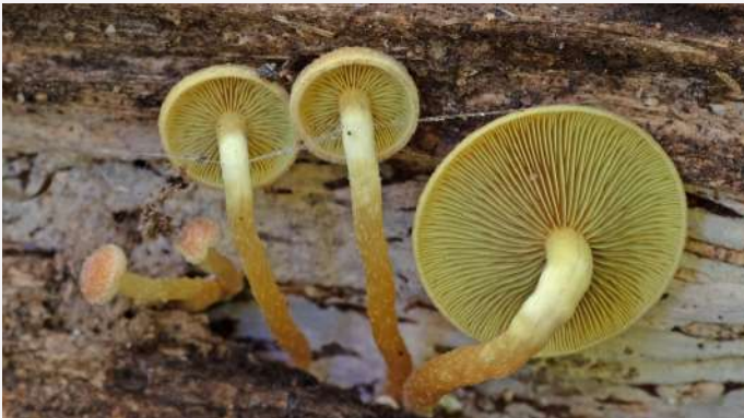
Sulphur Tuft Hypholoma fasciculare